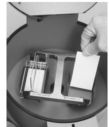
Figure 5. Replace absorbent pads monthly.