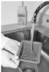
Figure 1. Clean baths, racks and stir bars after use.