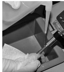
Figure 3. Clean sensors before and after each use.