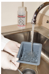
Figure 1. Clean baths, racks and stir bars after use.