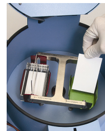
Figure 5. Replace absorbent pads monthly.