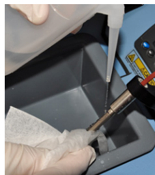
Figure 3. Clean sensors before and after each use.