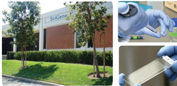
Training is performed in Sunnyvale, California, USA.