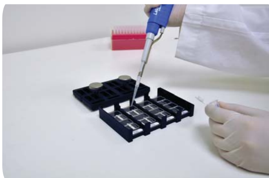
Perform manual and automated procedures under the direction of microarray technology experts.

During the three-day course, participants will analyze control and (optionally) clinical DNA samples that they provide. At the conclusion of the course, data files for each sample are provided for further analysis. In addition to learning improvements to manual methods, participants will also learn how to automate their laboratory workflow using SciGene equipment.