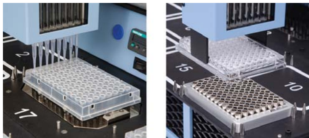
The ArrayPrep System automates reaction setup and magnetic bead purification of labeled products.

The ArrayPrep® Target Preparation System is a robotic system that automates DNA labeling using SciGene's ready-to-use kit or those from Agilent and Roche NimbleGen. The system automates reaction setup and purification and presents labeled samples ready for array hybridization. The ArrayPrep System requires less than 30 minutes hands-on time to process each batch of samples compared to many hours of technician time required to handle reagents, buffers and labware with manual methods.