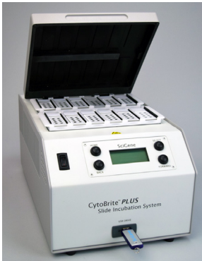
CytoBrite® PLUS System

Only FISH Hybridizer Compliant with New CAP Regulation CYG.33950*