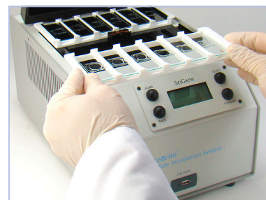
Removable trays simplify assay setup and reduce handling.