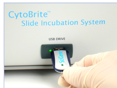
Captures time and temperature data to USB.