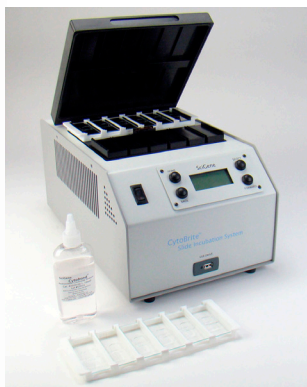
CytoBrite Slide Incubation System

Programmable slide incubation system for performing FISH/ISH hybridization protocols on 1 to 12 slides. Uses Peltier technology for rapid heating and cooling. Removable trays hold slides during probe addition, coverslipping and instrument loading. Incorporates new SlideSense™ technology to detect actual slide conditions for accurate and reproducible denature and hybridization temperatures. Slide temperatures are recorded during each run to a USB drive for transfer to the sample history record. For use with CytoBond Removable Coverslip Sealant, eliminating humidification during slide incubation.